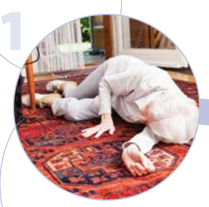
When Help is needed and you can't call 9-1-1